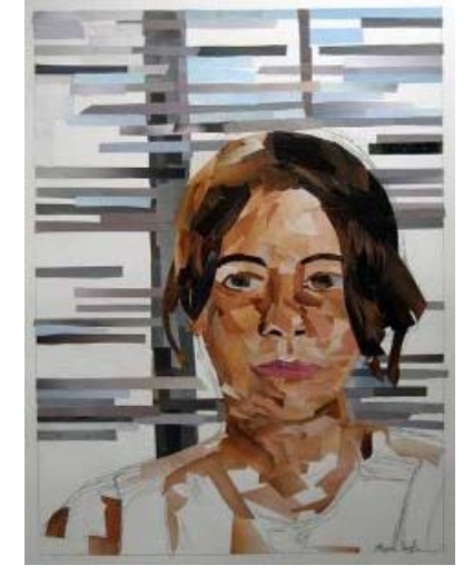
A collage by Megan Coyle

Finding your craft and your passion can be found at any age. I am happy for that she seems to have found her passion for collage at a young age. I always admire those that find it, recognize it and honor what they love. I also admire late bloomers too.